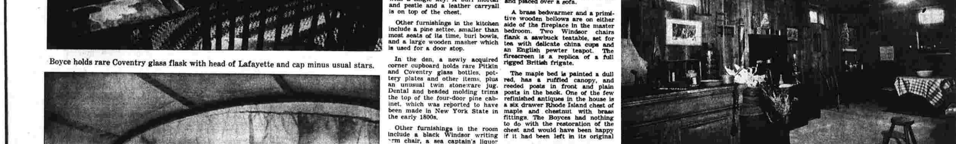
Country store atmosphere invites browsing and relaxation in recreation room.