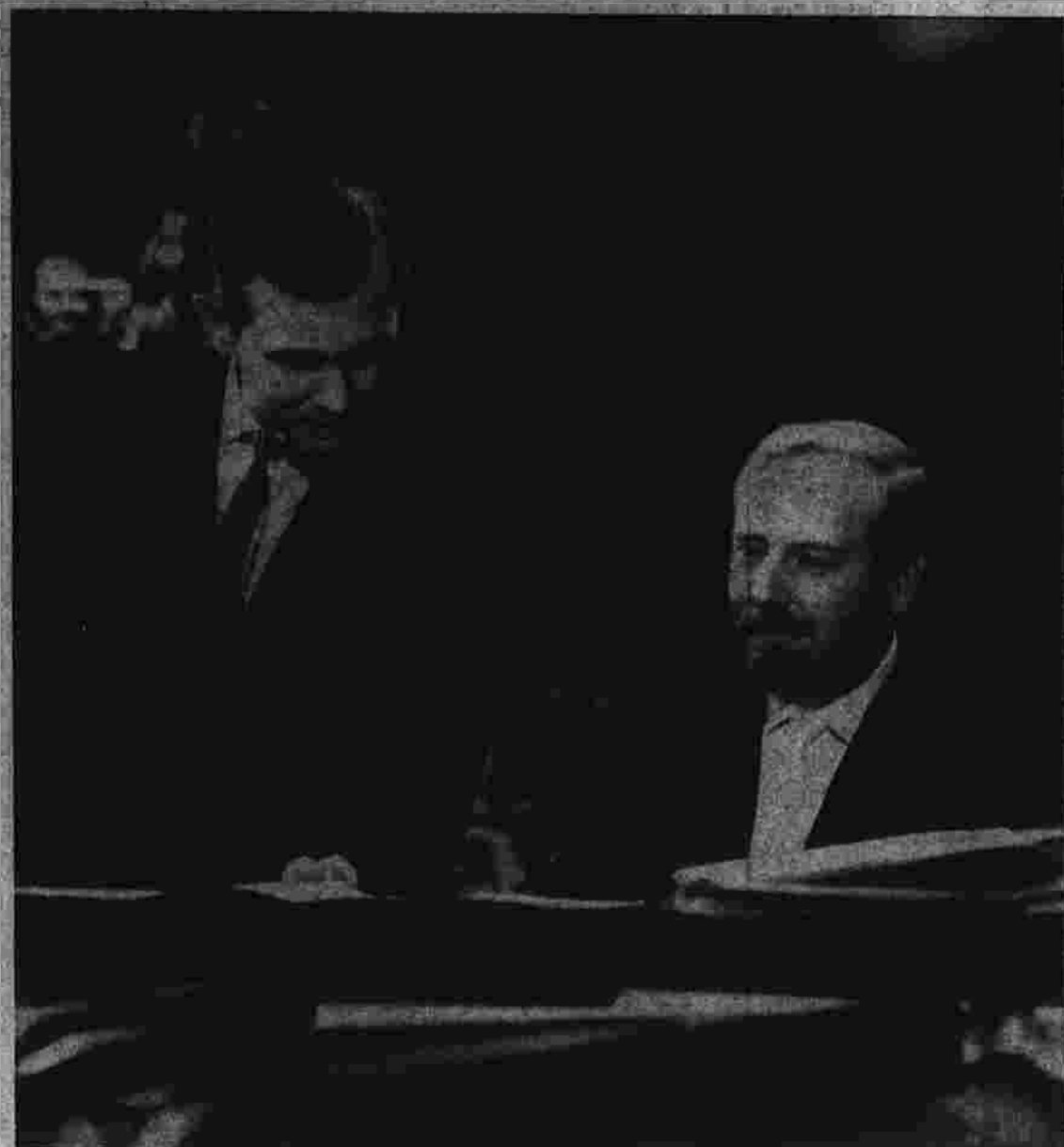
Johnny Carson and Skitch Henderson

"If I do have any secret about coming over O. K. it's because I let everybody else do his job. I've got enough to do with mine—per-