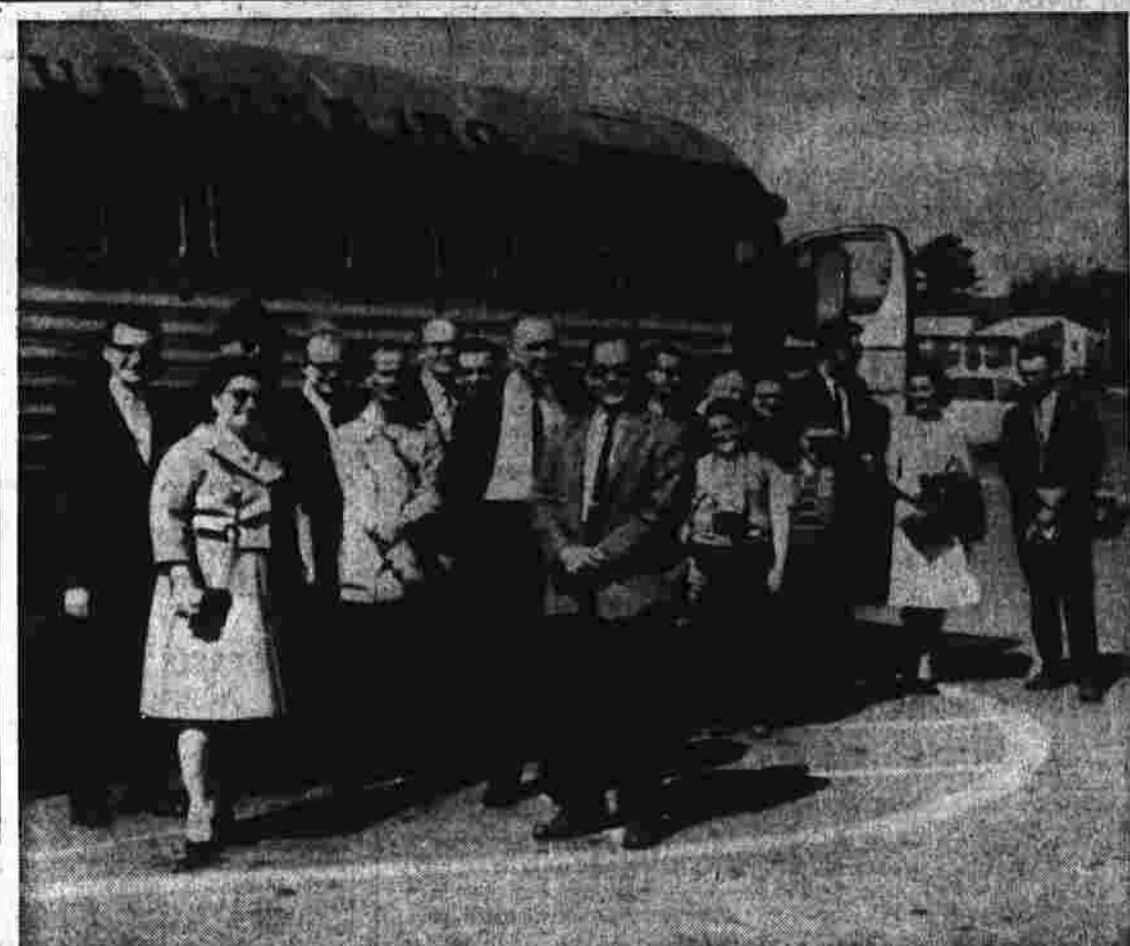
A group of Manchester area photo enthusiasts are shown prior to their leaving the Manchester Parkade parking lot last Sunday morning enroute to visit the second annual International Photography Fair at New York's Coliseum.